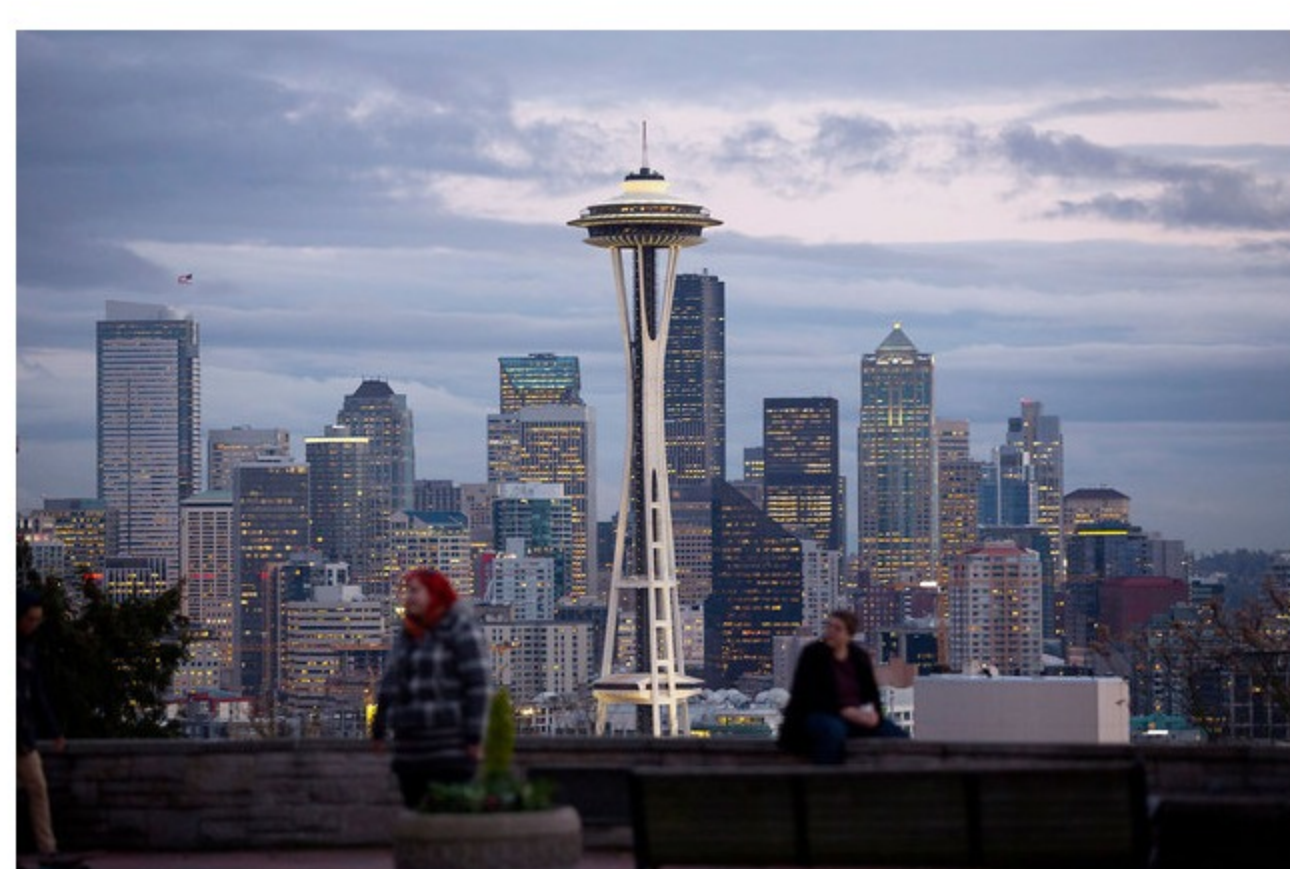
The Seattle skyline.